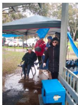
General Members Area