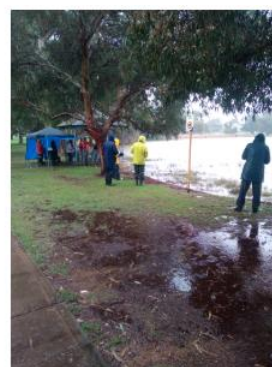
Central command (in bkgrnd)