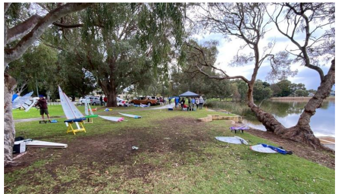
Becalmed lunch break